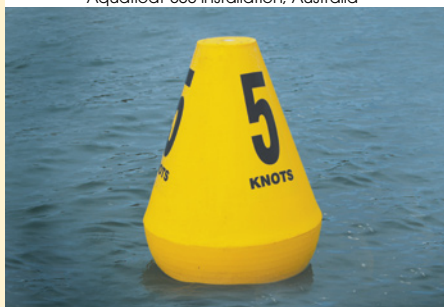
Aquafloat-800 installation, Australia

Moulded inserts on the top section of the float allow for convenient lantern attachment, and the entire buoy is available foam-filled to prevent water ingress in the unlikely event of damage.