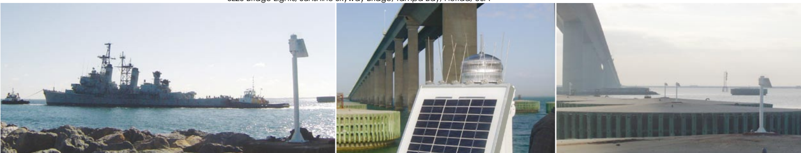
SL23 Bridge Lights, Sunshine Skyway Bridge, Tampa Bay, Florida, USA

Sealite SL23 and SL125/C lights installed on the large concrete islands located at the base of the Sunshine Skyway Bridge, Florida. This installation is designed to further enhance the safe navigation of mariners in Tampa bay, as well as the safety of the bridge - used by thousands of motorists every day.