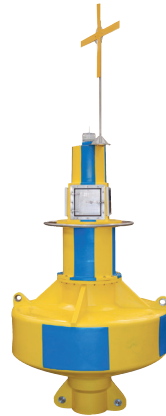
POSEIDON-1750 Wreck Marking Buoy

Sealite buoy products are made from recyclable materials. As a service to customers, individual components and products at the end of their service life may be returned to Sealite for recycling.